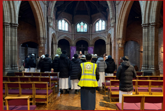
Year 10 students exploring the doctrine of Christianity

As part of their Religious Studies curriculum, Year 10 students recently had the opportunity to visit a local church, offering them a firsthand look at Christian practices and beliefs. The visit allowed students to learn more about Christianity and expand their knowledge. Guided by a knowledgeable clergy member, students learned about key Christian rituals, deepening their understanding of Christianity as part of their multi-faith studies. This visit marked an important step in broadening the students' awareness of faiths beyond their own, contributing to a more inclusive and respectful school community. By engaging directly with the church, students were able to enhance their understanding of Christianity and its significance, helping to broaden their perspectives as they continue to explore it in their RS lessons.