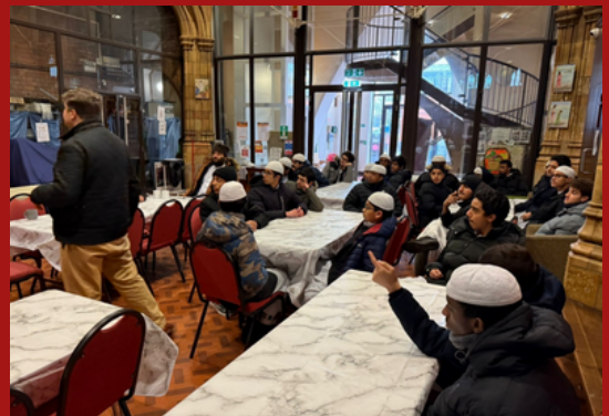
A look into the features of a Christian church