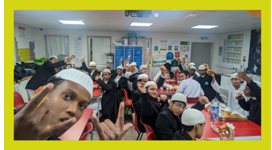
Year 11s enjoying a lovely meal